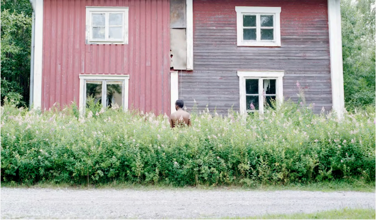
from the exhibition Homeplace

2026 Winter Session January 29th – February 1st